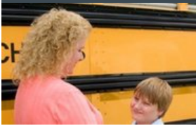
Signs that You Are an Overbearing Parent Education.com