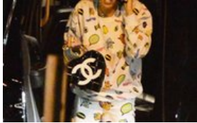
Miley Cyrus Boards a Plane in Pajamas, Leaves VMA Look... E! Online