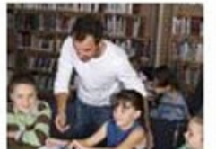
Is STEAM the Next Trend in Education? The Night Owl