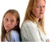
9 Things that May Scar your Kid for Life Education.com | An Education & Child Development Site for Parents | Parenting & Educational Resource