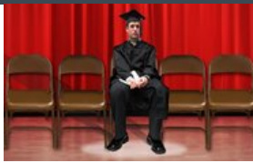
11 Public Universities with the Worst Graduation Rates The Fiscal Times