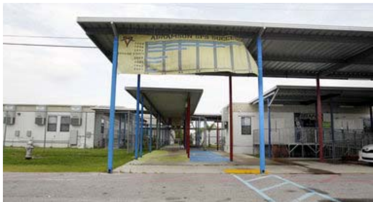
View full size

Though Abramson advertises a special focus on science and technology, state officials found lab materials "still boxed, with most of the instruments still packed and sealed" after two years sitting at the school.