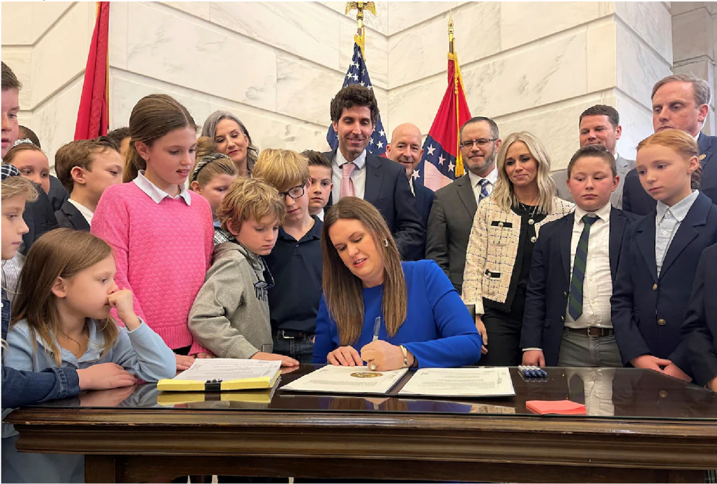
Arkansas Gov. Sarah Huckabee Sanders (R) signs a measure creating a school voucher program last year in Little Rock. Listen 13 minShareComment90Save

Billions in taxpayer dollars are being used to pay tuition at religious schools throughout the country, as state voucher programs expand dramatically and the line separating public education and religion fades. School vouchers can be used at almost any private school, but the vast majority of the money is being directed to religious schools, according to a Washington Post examination of the nation's largest voucher programs.