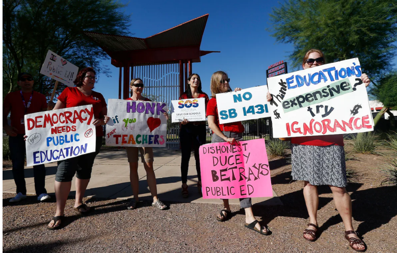
Members of Save Our Schools Arizona protest at the Arizona School for the Arts in 2017 as then-Gov. Doug Ducey (R) toured the Phoenix school. The group sought to delay expansion of the state's school choice program.

In Florida, several programs combine to make every student in the state eligible for vouchers, with more than 400,000 participating this year. At least 82 percent of students attend religious schools, The Post found. Florida is first in the nation in both the number of enrolled students and total cost of the voucher program — more than $3 billion this year. And in Arizona, more than 75,000 students are benefiting from the Empowerment Scholarship Program , which pays for any educational expense. In 2022-2023, three-fourths of the money — about $229 million — went to 184 vendors. Most of that money went for tuition, 87 percent of it to religious schools. Arizona also has an older voucher program, funded by tax credits, which last year subsidized tuition for at least 30,000 students. (The state tracks only the number of scholarships given, and one student can receive multiple scholarships.) Since this program was created in 1998, 19 of the 20 schools that received the most money were religious, according to a state report . Those 19 schools received about 96 percent of the $767 million spent between 1998 and 2023 at the top 20 schools.