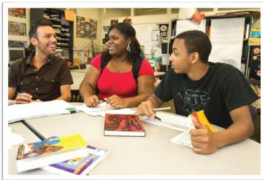
Big Picture Learning students with advisor.

The performance assessments are not standardized across BPL, nor do they use a common scoring guide. Their students are subject to federal and state testing requirements, which have in some cases undermined portfolio and performance practices.