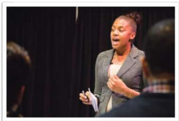
Big Picture Learning student presenting.

Clearly there can be many forms of assessment “for, of and as” learning. Indeed, one criterion for a good assessment system is the use of “multiple measures.” That means students have the opportunity to demonstrate their learning in varied formats over time. This, in turn, creates different ways in which teachers can assess to help students learn. At times, the term has been reduced to “several standardized tests” or “mostly tests with a bit of something else.” Those misuses