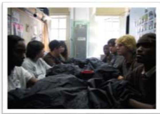
The Darkroom Photography class gets ready to process film for the first time.

As states think about overhauling accountability and improving schools, they could consider school quality reviews (SQR), modeled on the British school inspectorate (Rothstein, Jacobsen & Wilder, 2008, Ch. 7). Under this approach, teams of experts periodically review schools to provide them with feedback for improvement and for public reporting. The teams usually conduct multi-day visits that include shadowing students through their classes, interviewing staff, students and