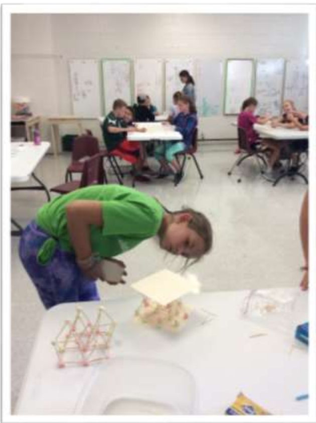
Photo from Rollinsford Grade School.

“Leaders and teachers in each district determine how to score their local competency-based assessments” (NHDoE, 2016b). Each district task creates its own rubric, though in some cases a