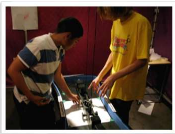
New York Performance Standards Consortium students.

Classroom-based evidence can include student work gathered and evaluated in portfolios, learning records, work samples, some of which include teacher observations. It can include performance tasks produced as part of ongoing academic activities. It also can incorporate student work done out of school, such as internships, and can include group projects. What