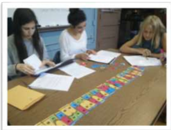
New York Performance Standards Consortium students.

What if re-scoring detects significant scoring discrepancies? New Hampshire says,