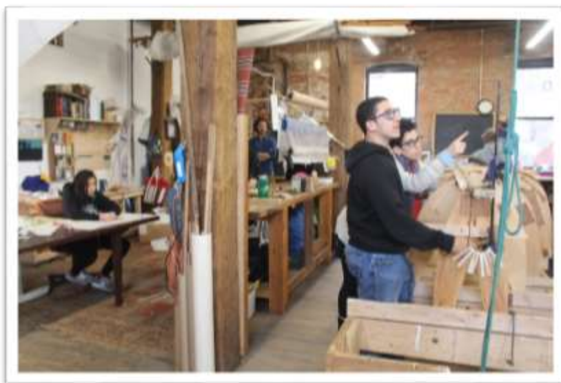
Students at a woodworking shop.

For example, several fifth and sixth graders decided to investigate river dolphins. Their display project, shared first with the rest of the school and then at a public open house, included biology and environmental science, writing up the results, assembling a graphic display, and selling tie-dye T-shirts to raise funds to support preservation efforts. They discussed their work,