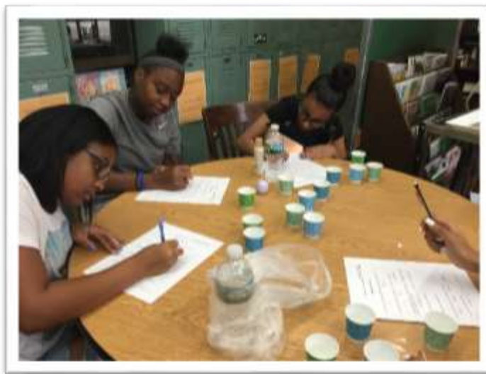
NY Performance Standards Consortium school.

The assessments can vary across districts — provided the results can be accurately compared. During the pilot period, the new assessments must also be comparable with current state tests. ESSA draft regulations list ways in which such comparability can be established. These include administering the state exam to all students in the pilot; or only to students in one grade each in elementary, middle and high school; or both the state test and the new assessments to a demographically representative sample of students in the pilot once in each grade span; or some other DoE-approved method a state creates.