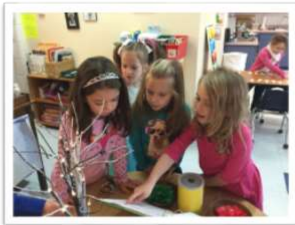
Kindergarten.

If the next U.S. secretary of Education understands the damage done by NCLB's focus on testing and wants to repair it, states could have the flexibility to move in the best possible direction. It will be up to assessment reform activists to persuade the new president to appoint a secretary