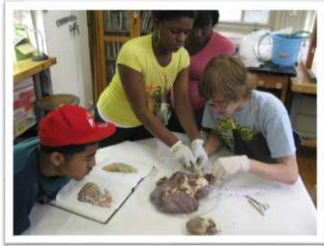
NY Performance Standards Consortium biology students at work.

The Consortium’s assessments are created by teachers and rooted in in-depth, project-based curricula and teaching. Its 2015 report, Education for the 21st Century , demonstrates that Consortium schools significantly outperform those in other New York City public schools while serving a similar population. In particular, more students from all demographic groups graduate, go to college and stay in college.