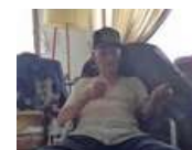
Verona man kills intruder