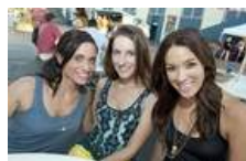
Photos: Train in concert at PNC Pavilion