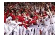
24 things to do in September