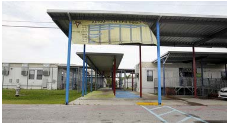
View full size

Though Abramson advertises a special focus on science and technology, state officials found lab materials "still boxed, with most of the instruments still packed and sealed" after two years sitting at the school.