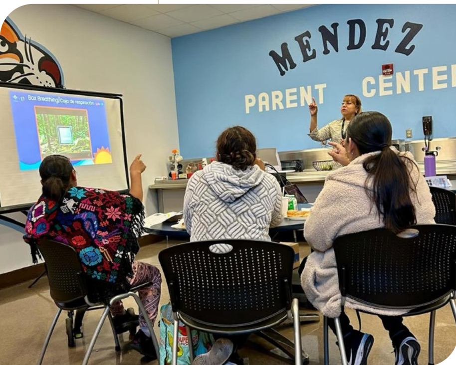
Parents learning how to manage stress at Felicitas & Gonzalo Mendez High School in Los Angeles, California.

In 2019, 85 percent of students reported feeling safe at Mendez. 84 Nationally, surveys suggest that less than 70 percent of students feel safe at school. 85 The school had zero expulsions between 2011 and 2021. 86 In 2020, Mendez's graduation rate had reached almost 90 percent, and the school had a 90 percent college-going rate. 87