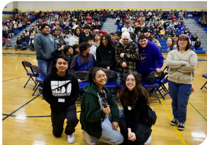
Students at a Changemakers presentation held at Deer River High School in Deer River, Minnesota.

Deer River's Anishinaabe program teaches cultural and local history through courses and field trips. 55 Students also learn business planning, marketing, public speaking, and other practical skills. The program, combined with grocery deliveries, home visits, and other resources requested by families, supported the school's students as Covid-19 exacerbated their community's already-difficult health care challenges. 56