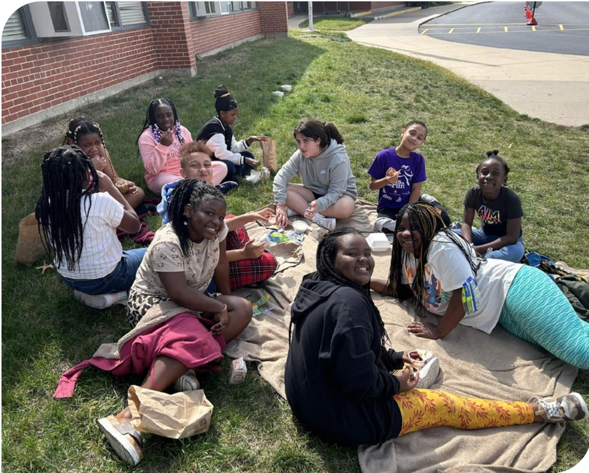
Students outside of Hoover Elementary School in Cedar Rapids, Iowa.

The school's community school coordinator visited every Hoover family at home, linked families with mental health providers, and amplified parents' voices. 27 The school added more diverse books to the library and incorporated them into classroom teaching. They expanded their selection of culturally diverse meals in the school's food pantry, which opened in 2018 and serves about 178 families in the Hoover community. 28 They also answered students' demands for more afterschool programs by starting new clubs and revamping the student council to increase student voice and advocacy. 29