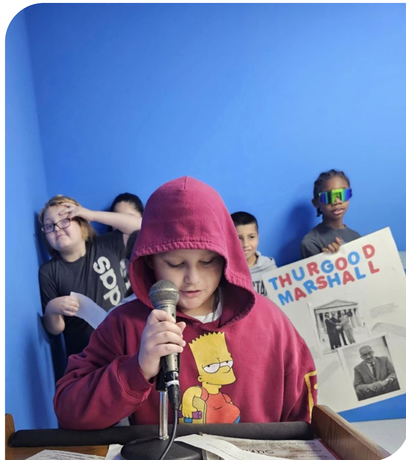
Students at Gibsonton Elementary School in Gibsonton, Florida, presenting as part of a student-led series for Black History Month.

In the 2017-2018 school year, Gibsonton received a grade of "D" on the state's annual report card that assesses elementary schools on the basis of their scores on standardized achievement tests. 8 By 2018-2019, Gibsonton raised its grade to a "C." 9 In 2023, Gibsonton was 14 points away from a state score of "B," the highest points it has earned since the start of the Florida State Assessment. 10