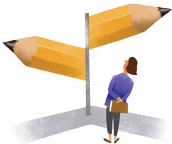
Figure 2: The Role of Teachers in School Leadership

As mentioned, our analyses suggest the presence of an imbalance. Some of those elements of instructional leadership and teacher leadership that are most strongly related to student achievement are least often implemented in schools.