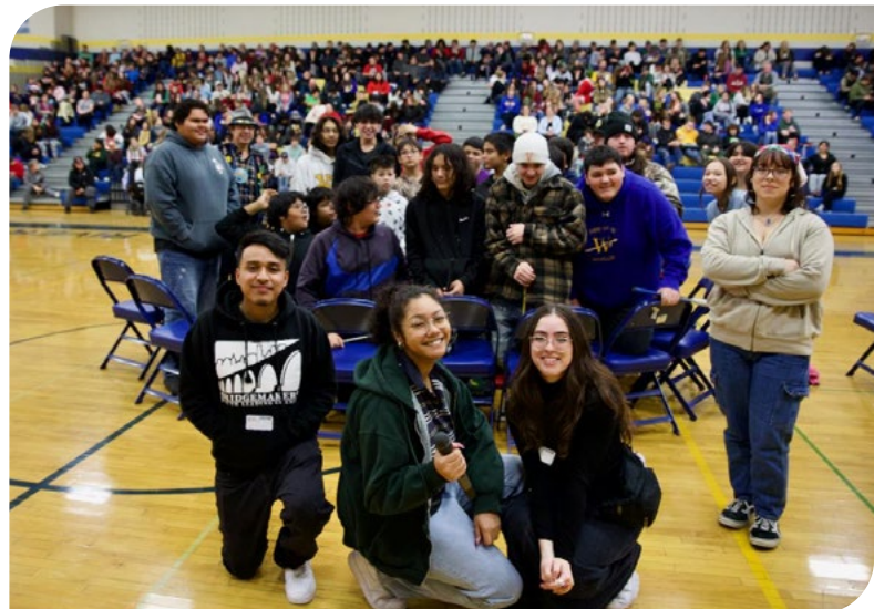
Students at a Changemakers presentation held at Deer River High School in Deer River, Minnesota.

Deer River's Anishinaabe program teaches cultural and local history through courses and field trips. 56 Students also learn business planning, marketing, public speaking, and other practical skills. The program, combined with grocery deliveries, home visits, and other resources requested by families, supported the school's students as Covid-19 exacerbated their community's already-difficult health care challenges. 57