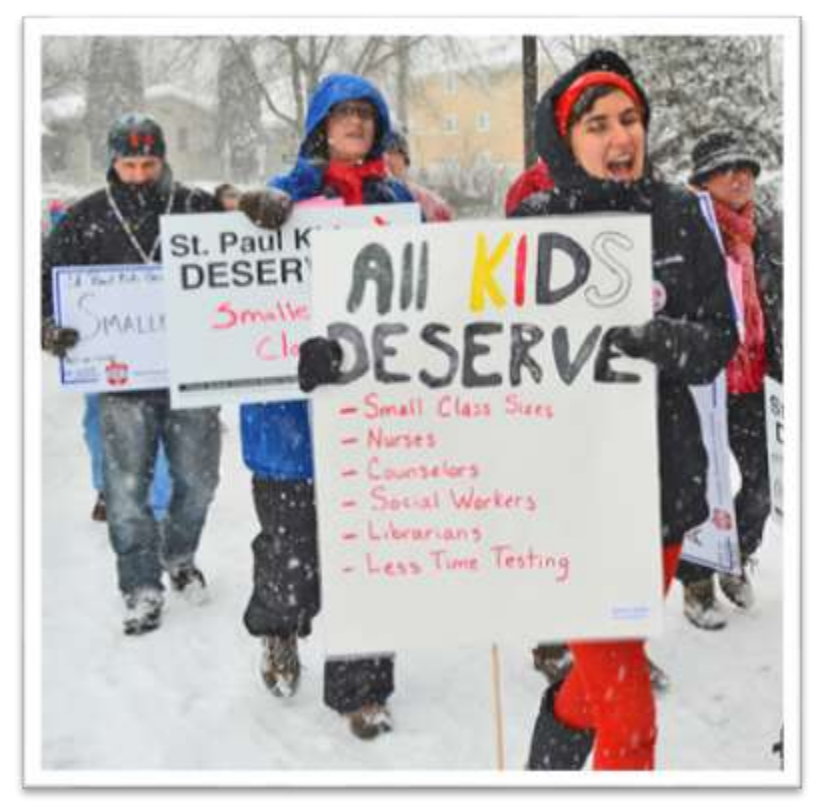
St. Paul teachers protest in the snow.

Teachers also won elimination of MONDO benchmark literacy testing for elementary students, which they said was extremely time-consuming and not helpful. (MONDO is being replaced with another less timeconsuming assessment that