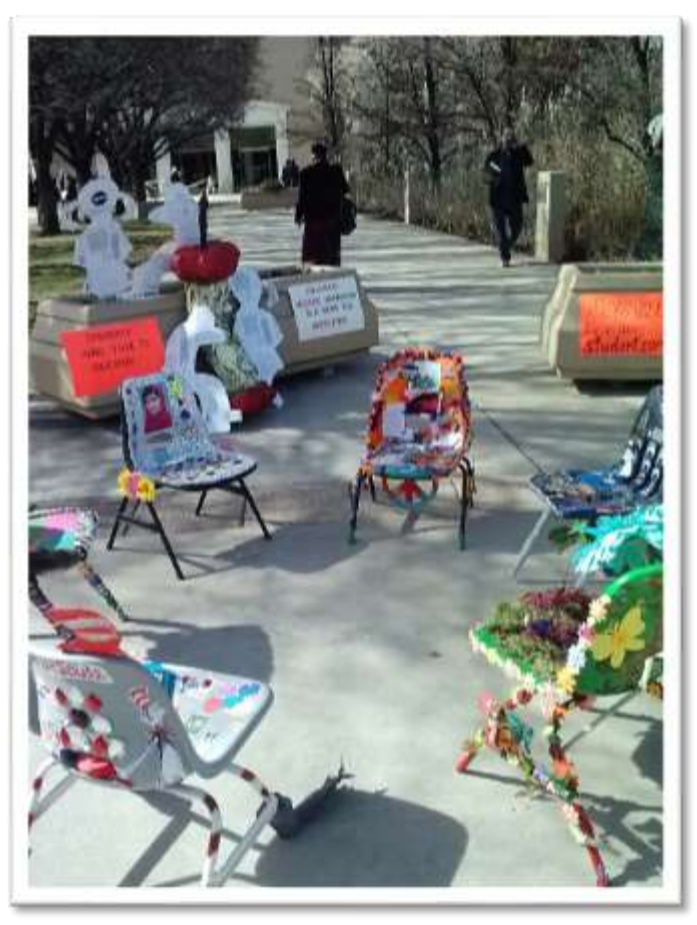
"Art chairs" set up by NEA Santa Fe at state house.

union leader as plaintiff) against NM Public Education Department (PED) for its gag order on teachers regarding testing. The PED order said public education employees must not "disparage or diminish the significance, importance or use of standardized tests." Penalties could include "suspension or revocation of a person's educator or administrator licensure or other PED license."