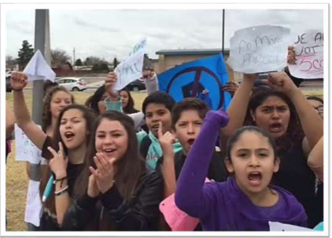
Middle School students protest over PARCC testing in Las Cruces.

Winning the school board election was decisive for future progress, though activism had already gained victories.