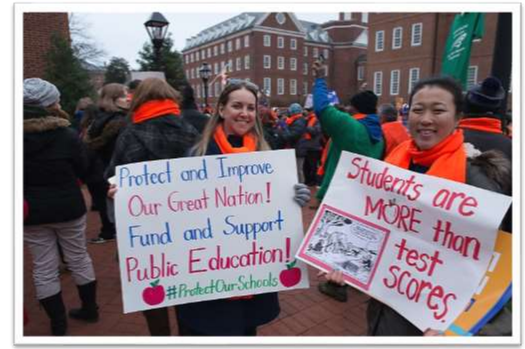
Maryland Demonstrators, March 2017.

Business groups were not involved; aside from charters, they have stayed out of Maryland education politics. The right-wing Maryland Campaign for Achievement Now (CAN, affiliated with national CAN) opposed the ESSA bill but did not organize effectively on it.