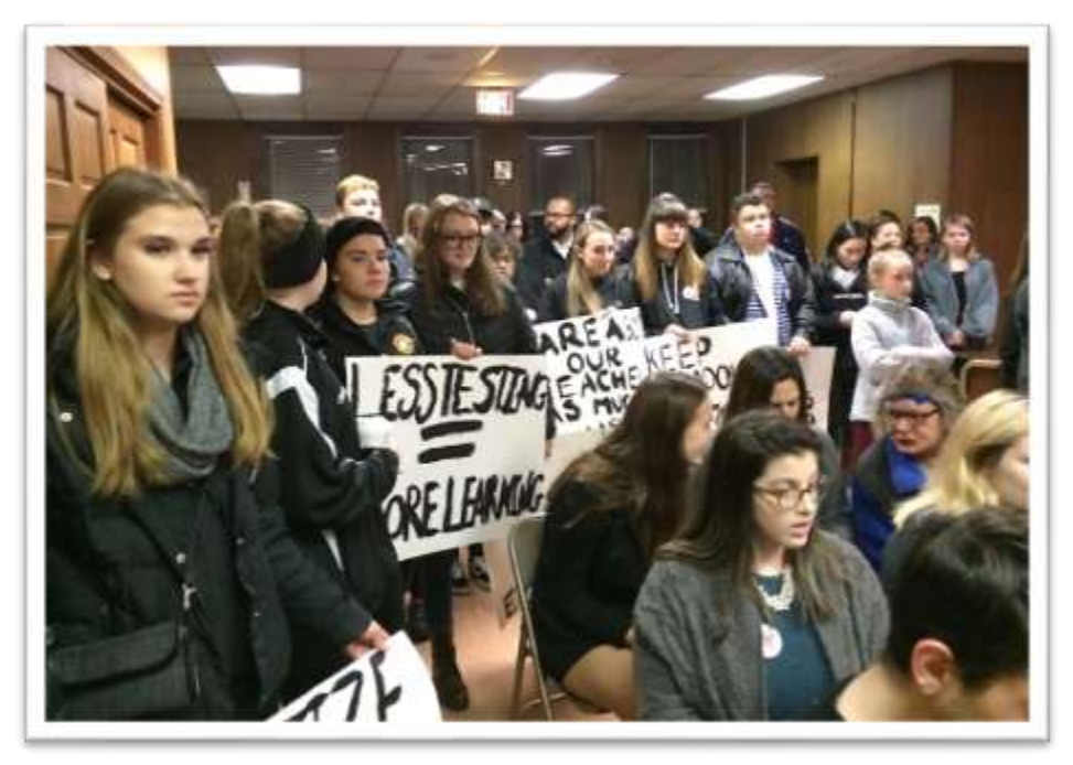
Chicopee, Mass., students rally to support their teachers and schools.

There are key lessons for other test reform activists from these state