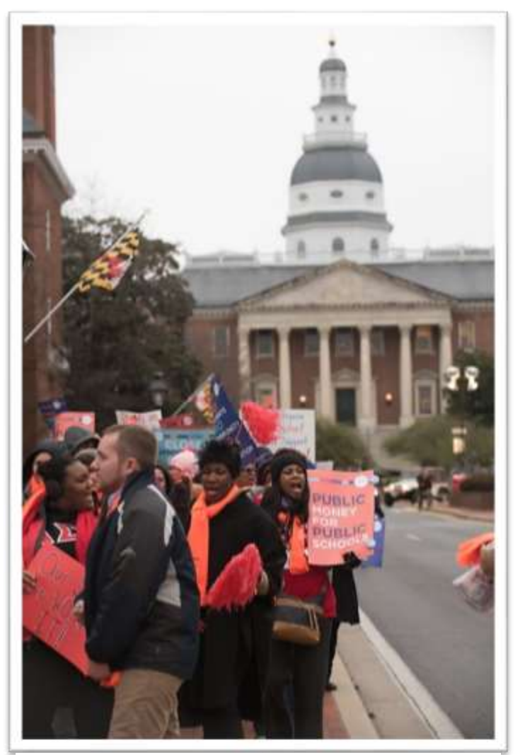
MSEA demonstration. March 2017

Shift from a focus on funding to professional practice: Historically, education advocates in Maryland primarily focused on funding rather than professional practice issues. Shifting focus meant getting comfortable with new areas of statelevel policymaking, new strategies, and an expanded definition of how to advocate for the best possible school system. In the case of testing, it also meant battling with school boards and superintendents, who are allies on funding. It meant framing the issues for the public – what makes for good schools in addition to sufficient money.