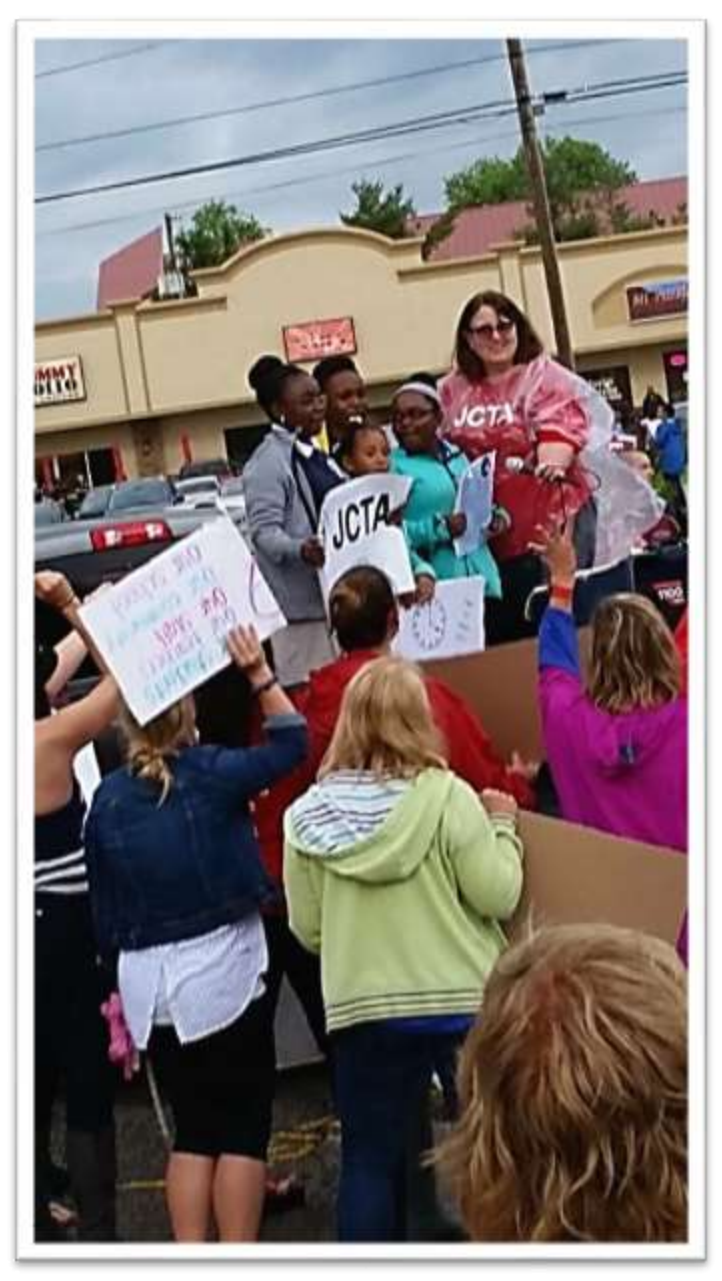
Jefferson County, KY, teachers rally.